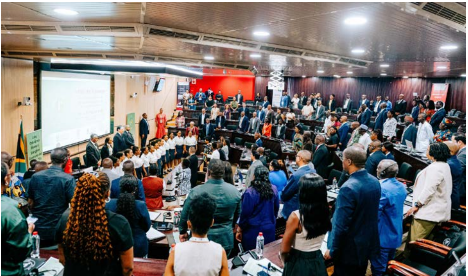
African Ombudsman Research Centre (AORC) Relaunch & Training.