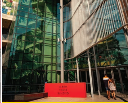
Nelson R. Mandela School of Medicine