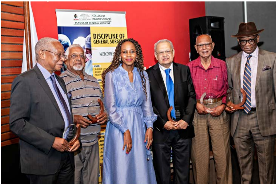
Updates in Surgery Annual Symposium.