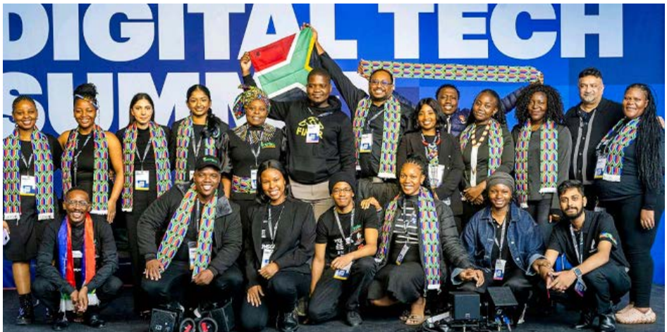
UKZN Law School Hosts Inaugural Junior Internal Moot Court Competition.

Courses offered under each Master's programme include a compulsory research methodology module and a dissertation/three research papers together with a selection of specialised modules.