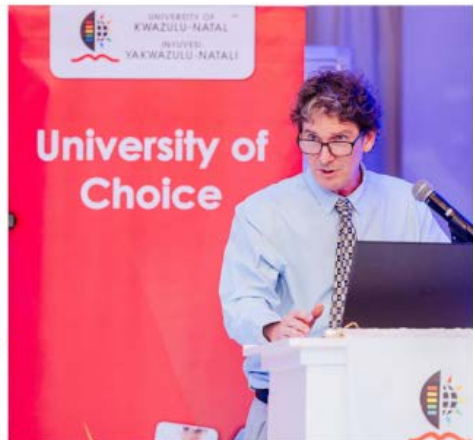
UKZN Awards Celebrate Innovative and Transformative Research.