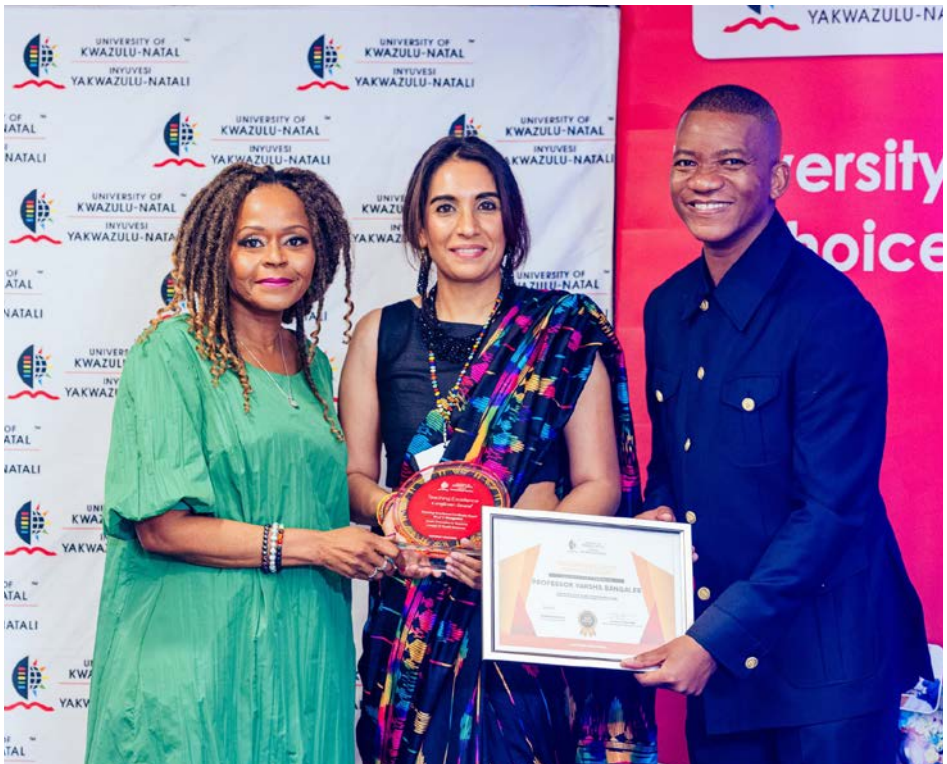
Vice-Chancellor's Teaching Excellence Awards

Students will be required to pursue an approved programme of research on a subject falling within the scope of studies at the University. Such a programme shall make a distinct contribution to the knowledge or understanding of the subject and afford evidence of originality shown either by the discovery of new facts and by the exercise of independent critical power. Students must also adhere to other possible conditions prescribed by Colleges/Schools.