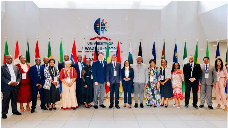
African Ombudsman Research Centre (AORC) Relaunch & Training.