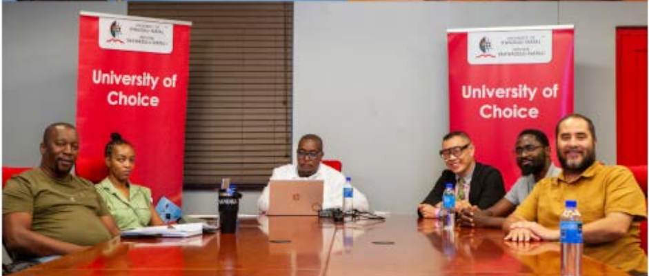
UKZN hosts Hybrid Seminar on the Sponge City Programme and Flood Resilient Communities.