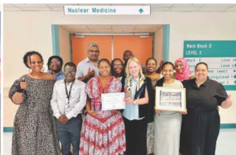
Prestigious Saul Hertz Young Investigator Award for Breast Cancer Researcher, The Nuclear Medicine team behind the magic!