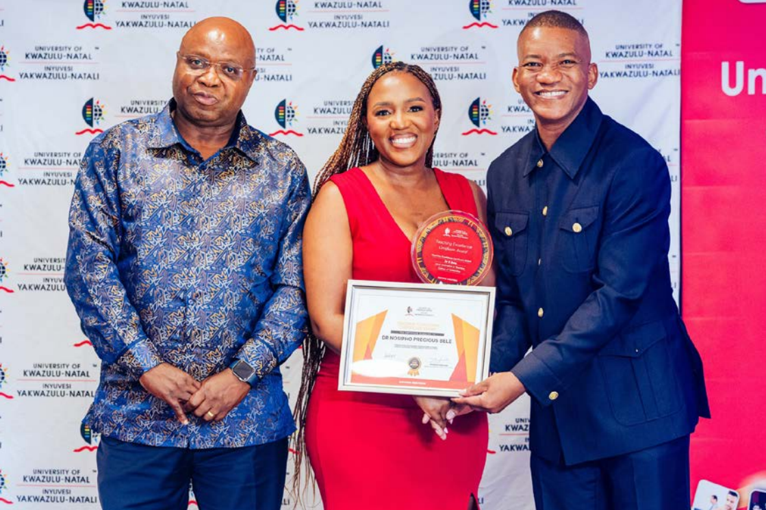
2025 Vice Chancellor's Teaching Excellence Awards.