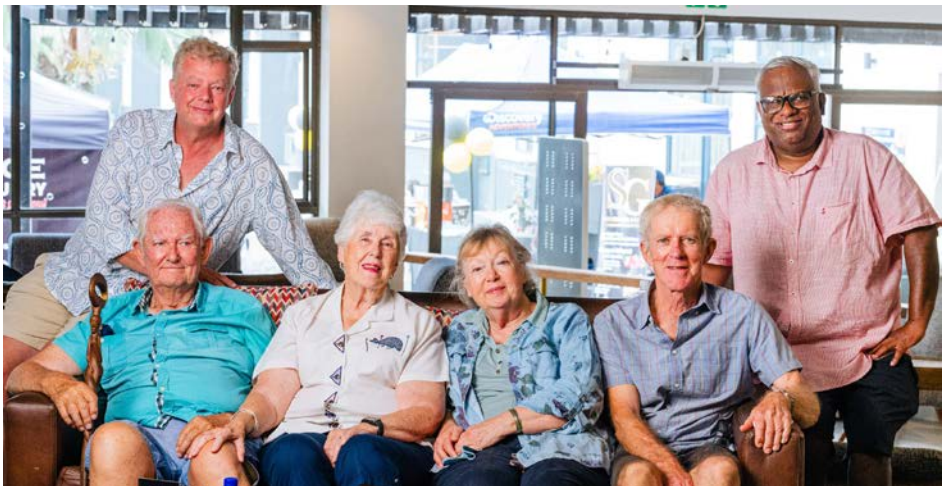
UKZN Alumni Relations

The Master of Science in Agricultural Engineering is offered at the Pietermaritzburg campus.