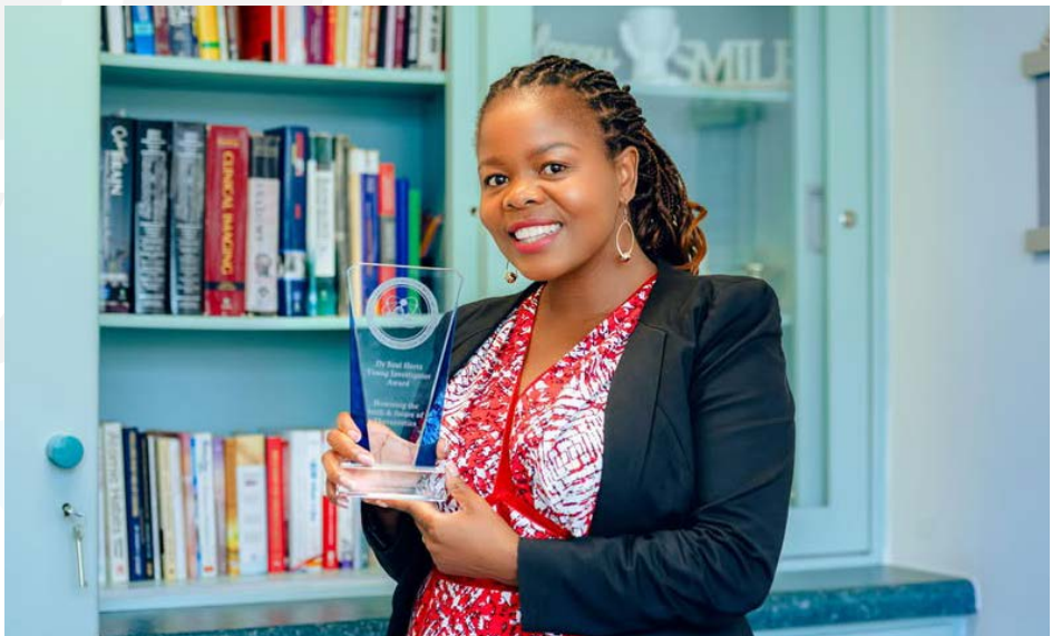
UKZN Academic Scoops Prestigious Award for Cancer Research.

Candidates shall be required to pursue an appropriate programme of research on a subject falling within the scope of the studies presented at the University. Students must also adhere to other possible conditions prescribed by Colleges/Schools.